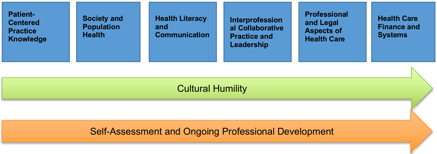
Figure 2. The six building block domains and two cross-cutting domains

The task force also believed it was essential to consider the external influences on the PA profession as the health care landscape continues to evolve. They determined that four major environmental factors — social determinants of health, population health, health system delivery and capacity, and higher education — will continue to impact the profession in unpredictable ways.